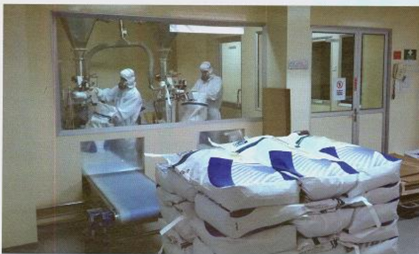
Rhone Ma's GMP-certified plant processes include mixing, blending and dilution of concentrates.