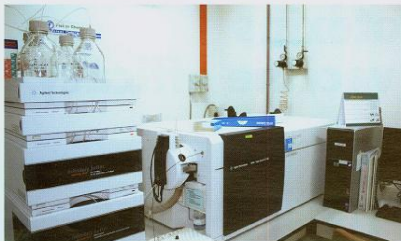
Left: Rhone Ma sister company Vet Foods Agro Diagnostics has invested in top-grade scientific equipment at its laboratory allowing the company to conduct a wider scope of tests.