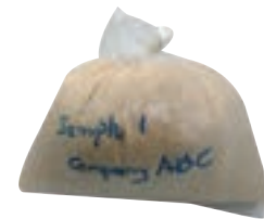
Diagram 2: Packing of sample